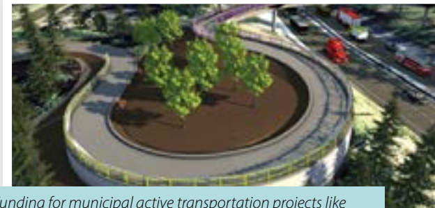
Funding for municipal active transportation projects like Casano-Loutet Overpass, Hugo Ray Path, and in Lynn Valley will provide people with safer routes to walk, cycle, and roll.