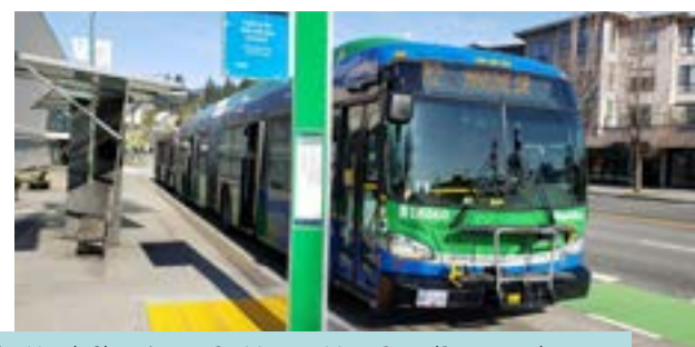
The North Shore's new R2 Marine-Main RapidBus route has launched.