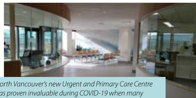
North Vancouver's new Urgent and Primary Care Centre has proven invaluable during COVID-19 when many private walk-in clinics closed to in-person visits.