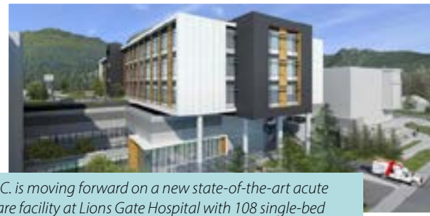
B.C. is moving forward on a new state-of-the-art acute care facility at Lions Gate Hospital with 108 single-bed rooms and eight new operating rooms.