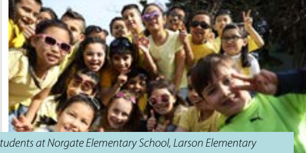
Students at Norgate Elementary School, Larson Elementary School, and Gleneagles Elementary School will enjoy new playgrounds thanks to provincial funding.