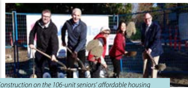
Construction on the 106-unit seniors' affordable housing complex that will be operated by Kiwanis has begun.