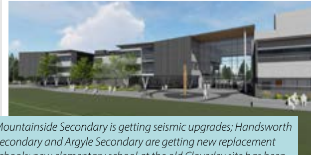
Mountainside Secondary is getting seismic upgrades; Handsworth Secondary and Argyle Secondary are getting new replacement schools; new elementary school at the old Cloverley site has been approved to move to the next stages of development.