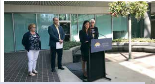
The North Shore Youth Safe House, which takes in upwards of 150 youth per year, has stable funding from the province for the first time in its 10-year history.

North Vancouver will be getting two new provinciallyfunded affordable housing projects: a 106-unit seniors' housing complex and a 90-unit family-oriented project.